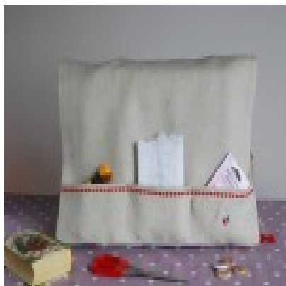
Sewing Machine Cover